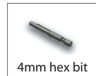
4mm hex bit